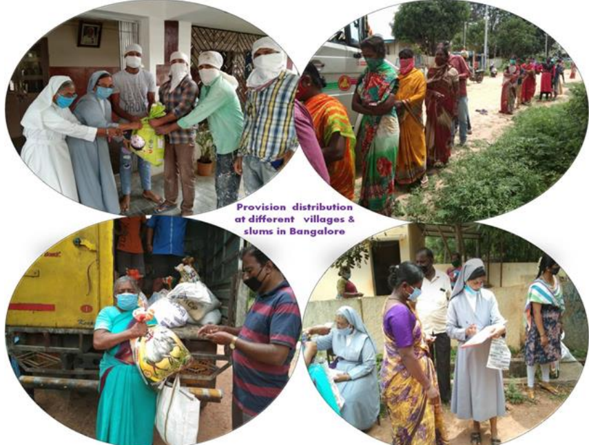
Provision distribution at different villages & slums in Bangalore