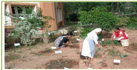
Medicinal Herbs Garden