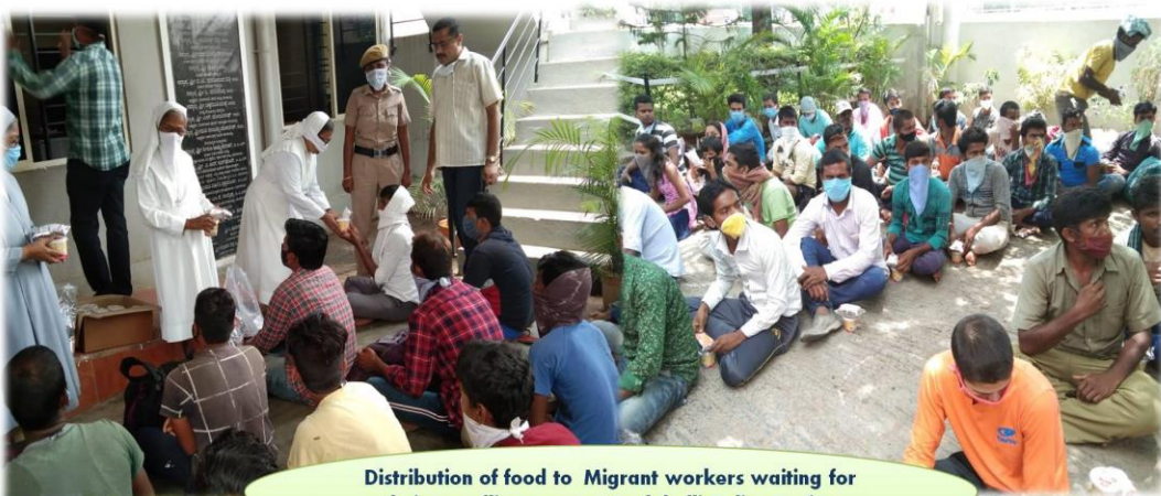
Distribution of food to Migrant workers waiting for their travelling pass at Avalahalli Police Station