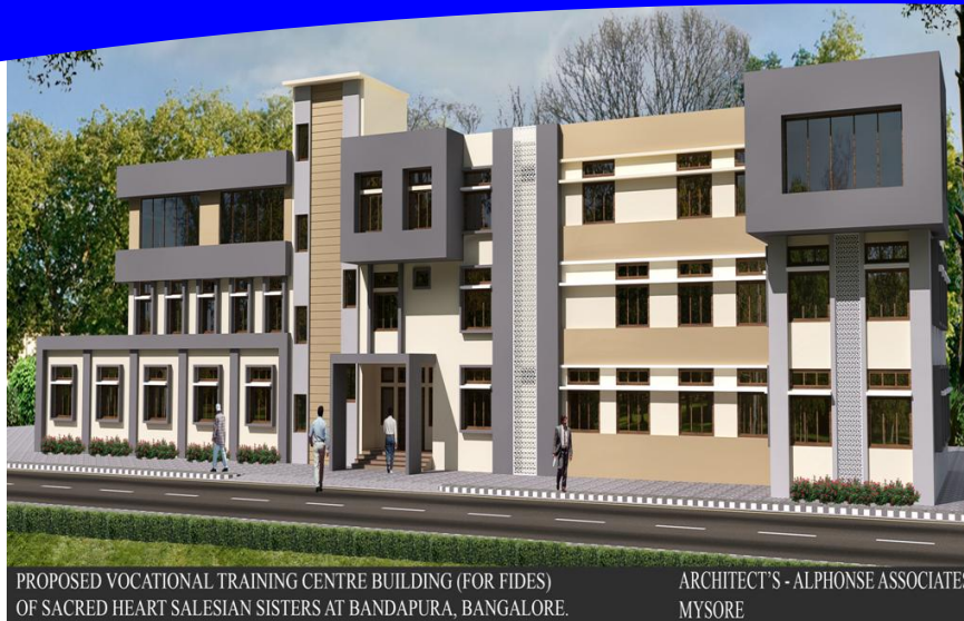
PROPOSED VOCATIONAL TRAINING CENTRE BUILDING (FOR FIDES) OF SACRED HEART SALESIAN SISTERS AT BANDAPURA, BANGALORE.